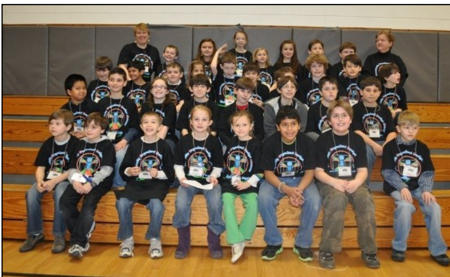
Our Lady of Mercy's 43 Robotics participants take time out to pose for a photo at the Robotics Park competition held April 2, at Edward R. Martin Middle School in East Providence.

See us in color online at http://www.olmschool.org/activities.html and click Jaguar Journal